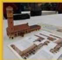
Over 50 great clinics