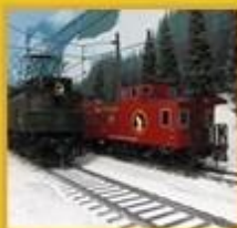
Layout Tours of all scales