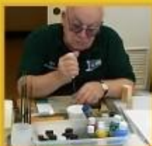
Modeling With The Masters®