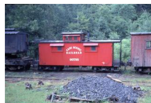
May Contest, Cabooses.

To enter the May Contest, email 1 to 3 photos in JPG format only along with the Contest Entry Form as a PDF file to division8.mcr.nmra@gmail.com . Contest dates will also be listed in the Groups.io Calendar. And as always if you have questions, comments, or need help, email division8.mcr.nmra@gmail.com . We will publish the Contest timeline dates each month in The Pie Card .