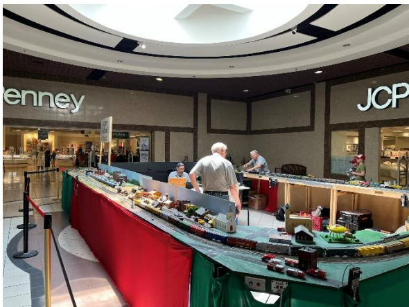
Left: Southern Indiana and LCL layout. Since each layout has slightly different design standards, the clubs built transition modules to make them compatible.

Over Father's Day weekend, the Southern Indiana Railroad and The Louisville Connecting Lines (LCL) Model Railroad Club set up their joint modular layout in at Greentree Mall in Clarksville, IN. Division 8 participated with an information table.