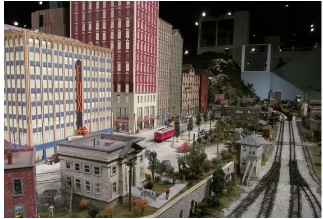
Above: A scene from the "modern era" section of EnterTRAINment Jct. This is G-Scale. (more photos on page7)

THURSDAY, FEBRUARY 9, 2023, 6:30 TO 7:30 PM