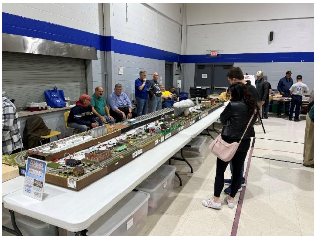
Left: T-Track N-Scale Modular layout. The Lionel Operators Club layout was also set up at the show.