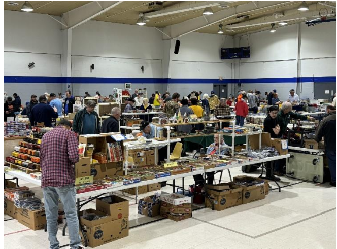
Below: A view of the show.