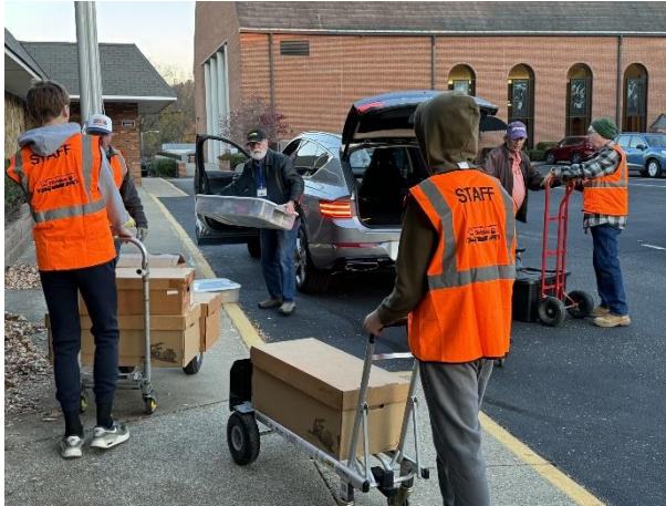
Left: The day began with dealer move-in assisted by Division 8 members and young people from Holy Family Parish.

Thank you to all our members and our dealers for your help with the Division 8 Train Show & Sale on November 11, 2023. It was a huge success, and it would not have been possible without the hard work and dedication of many. We made sure that everyone had a positive experience, and that the show ran smoothly from start to finish. Thank you all for your willingness to donate your time - a commodity that for some of us is increasingly fleeting. Your generosity with your time is greatly appreciated. Enjoy a few pictorial highlights from the Show. Division 8 Board of Directors