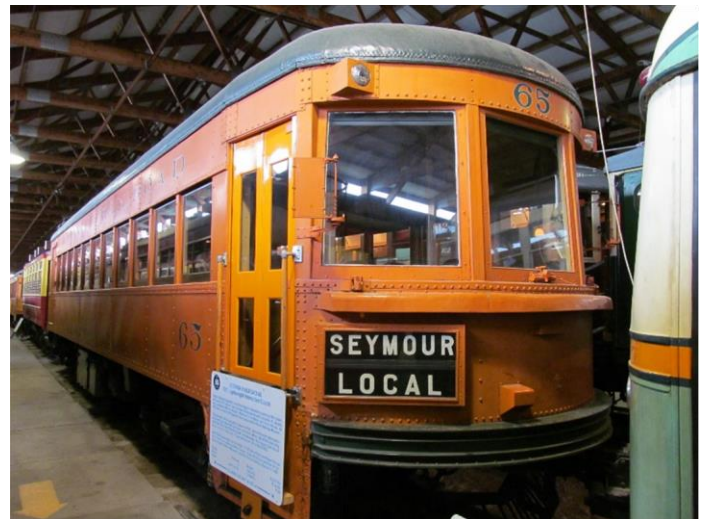
Indiana Railroad #65 preserved at the Illinois Railway Museum in Union, IL.

A final observation is this. Now that the idea is gaining more traction (pardon the pun) for either Amtrak or high speed rail service to Chicago it's worth noting that what we want today, we threw away a little more than 100 years ago. And, by the way, Sam Insull's greatest creation, Commonwealth Edison still survives and serves the citizens of Chicago to this day.