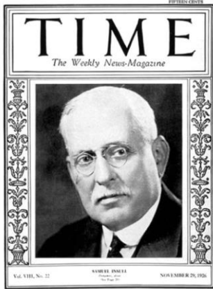
Samuel Insull Public domain photo

I haven't had much to contribute to The Pie Card lately but this is something new for me so I thought I'd share it with you.