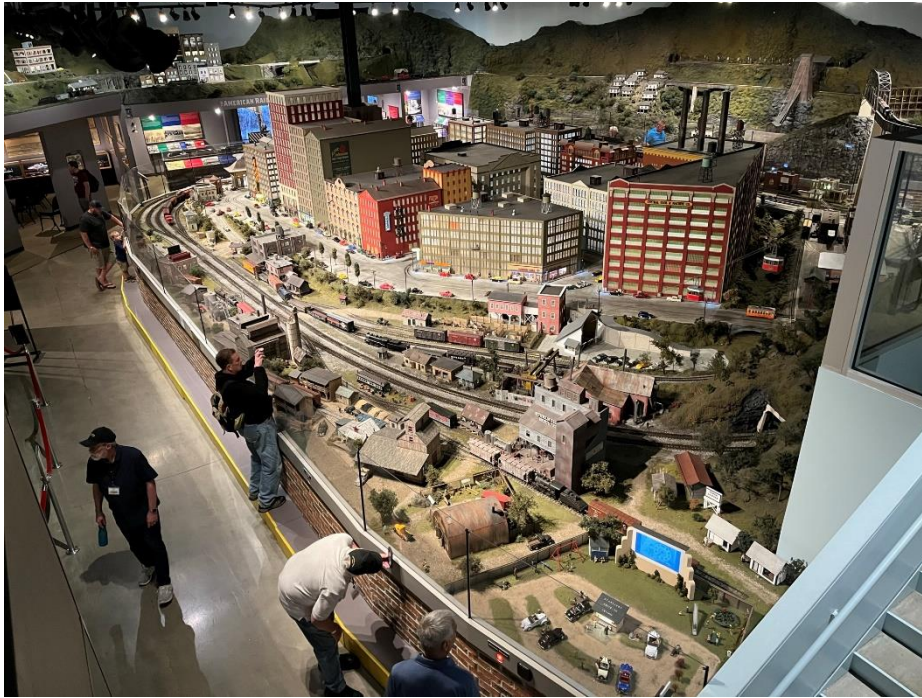
Left: There are four Division 8 members in this photo.