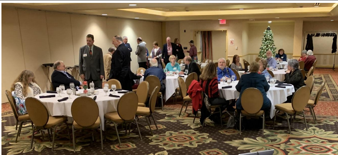
Christmas Party 2022

How far “out there” do we want to go for the meal? Probably not pizza or a taco bar or grilled burgers, but what about a catered meal from one of the bar-b-que restaurants in town? Let us know what YOU think and what YOU would like to do next year. For me, I want the price significantly lowered, but I want to make sure the meal is really yummy, too.