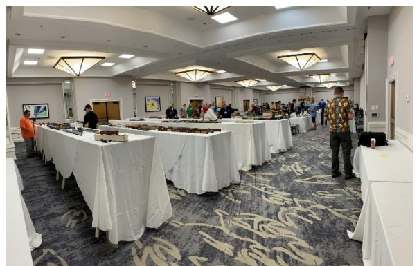
Display and Vendor Room

If you attended the January 8, 2022, Gathering or if you saw the video of it on our YouTube channel, you saw my "live" broadcast from there and you already know how much work the attendees put into their modeling efforts. Although the video was good, there's just no way an iPhone can show all the fine details during a Zoom call. Y'all just have to be there in person to take it all in. The sheer volume of finely detailed equipment was overwhelming. It was easy for me to spend way too much time just looking at all those models on display. But it sure did get me motivated!