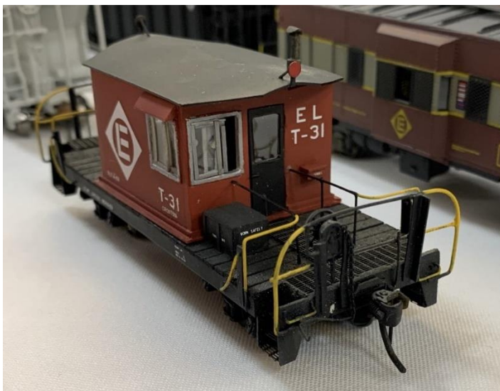
This Scratch Built Transfer Caboose was just one of the many super detailed and weathered pieces of model railroad equipment displayed during the event

The biggest difference from our MCR conventions was the on-site sellers/dealers/exhibitors. It's not unique to an RPM event. The National Narrow Gauge Convention (NNGC) does the same thing. What was nice was the lower number of attendees (just over 200) compared to the NNGC (around 1,000). That meant there were not as many people jockeying for position to talk with those folks and that meant I could have conversations and not feel like someone was constantly looking over my shoulder for time with the seller. Over the next few months, I'll be sharing some of what I learned.