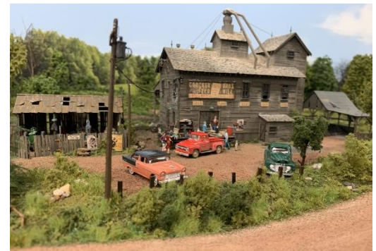
Above. One of many highly-detailed scenes on Maynard Mitchel's HO scale CNW-based layout.