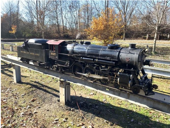
Above. 4-6-2 Michigan Midland steamer is cooling off after running on the 7 1/2" scale outdoor railroad of the Mid-Michigan Railroad Club in Marshall, MI

It wasn't nearly as cold as I thought it would be in Michigan last month and the fall colors were awesome around Kalamazoo. All in all, I had a great long weekend attending the Division 9, North Central Region, NMRA, Mini-Convention, October 28-30, 2022. The convention was actually just the first two days, but the local Kalamazoo Model Railroad Club hosted their annual Fall Train Show on the third day, so I'm calling it a three-day convention.