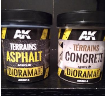
AK Terrains Diorama products.

While surfing the internet during the COVID lockdown, I found this product that the military diorama guys use. They have a lot of different terrains. I found some on the internet by googling “AK Terrains”. After things opened back up, I saw that Scale Reproductions carries this product, and can probably order it if not in stock.