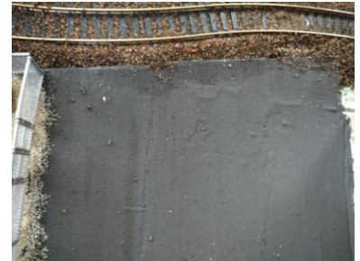
Road using AK Asphalt

When it came to using it, I tried it two different ways. First, I used the Woodland Scenic Paving Tape, laid it down, and spread the concrete between the tape and smoothed it out and let it dry. I then pulled the tape up. The second way I found to be the easiest to do and also does not use very much product. Take foam board, cut it out in the shape of my road or