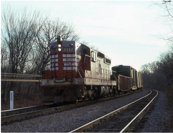
Still wearing CB&Q Chinese Red, a BN SD9 is at Warner, IL, a siding on the BN (ex-CB&Q) line between Galesburg and Savanah, Illinois

A “Toucan” is an exotic tropical bird of vivid plumage with a colorful beak. At least, that’s how I would define “Toucan”. What does that have to do with trains, you might ask. To me, there were some railroads that had colorful paint scheme’s but that just lacked that certain “something” that would have made them truly “colorful”. The UP for instance, had the good sense to stick with a great color scheme (to this day, I might add) but, to me, was just “UP”. The Santa Fe, on the other hand, had the panache to go with a great paint scheme. I could cite other examples.