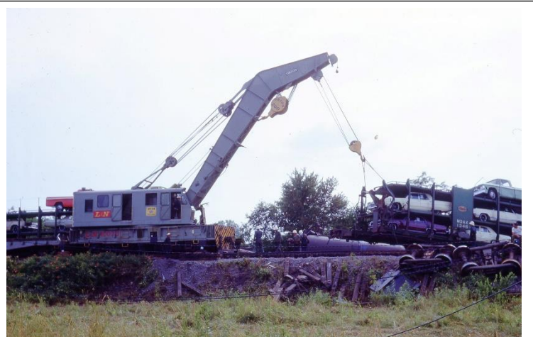
L&N "big hook" clearing a wreck on the Lebanon Branch in 1968.

Where the carmen really earned their money, though, was in cleaning up a bigger derailment. The higher the speed prior to the derailment the more cars would be in the ditch and farther away from the track they could go. The physical violence involved in a major derailment could be astonishing. You could look out over several acres of damaged freight cars, freight car parts and lading spilled from the cars. And, unfortunately, back in the days when both animals and people in passenger trains were not uncommon, encountering bodies and body parts was part of the job, too.