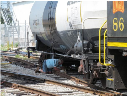
Rerailing a car on the Louisville, New Albany & Corydon R.R.

Occasionally, one's idea of what looks like a neat job changes. When I was a kid, back in the fifties (Oh, Ouch!), the standard questions from newly met adults was "what do you want to be when you grow up, kid". The standard, approved answer was "I wanna be a policeman!" or, "I wanna be a Fireman!". Of course, this was a child's view. After you got older and you realized what they did such as go in burning buildings when they had no idea what flammable items that could go "BOOM" might be in there, your enthusiasm could melt away.