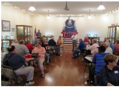
2017 Division 8 Picnic at the Depot Museum.

Come join us at the Annual Division 8 Picnic, Saturday July 31, 2021. We will gather at the Depot Museum, 206 South College Ave, Salem IN 47167-1304 between 11:00 and 11:30 AM and eat at Noon.