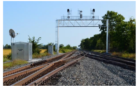
Fostoria, OH.

and, Engineer which gives you every camera they have. The Conductor and Engineer packages come with modest monthly fees. Wow! Sit at my computer warm and cozy at home and watch trains! Modern life does offer some impressive perks! I would caution that live video streaming requires a good high-speed data connection. I blew through my Verizon monthly Wi-Fi allotment in a couple of days and now am looking at ways to get better, truly unlimited internet.