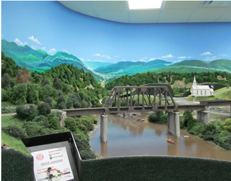
Left: Deepwater Bridge crossing the Kanawha River.